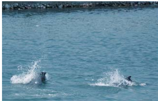
Fig.3 Herding behaviour of S. chinensis

While feeding, the individuals moved in various directions without any obvious pattern, diving frequently in an asynchronous manner. There was no obvious co-operation among individuals during feeding. The major foraging strategy of the dolphins observed in this work was herding, where one or more dolphins herded a school of fish from deep to shallow waters of the estuary either towards the sea wall (Fig. 3) or towards the beach and fed on them on those trying to jump out of water in confusion. The dolphins moved at great speed, swimming inverted down or on one side. Each chase usually lasted for about one to two minutes and the bout consisted of zig-zagging movement, followed by a short, fast leap. The solitary dolphins exhibited this behaviour several times a day and were observed in the same area for a long period of time. Though the movement of individuals was in all directions, the chase was perpendicular to the sea wall.