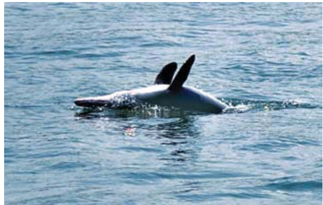
Fig.6 Floatation, a resting movement

As part of socializing behaviour, they exhibited leaps, high speed movement with frequent direction changes, and body contact with other individuals (Fig. 7). Porpoising, the high-speed surface piercing motion of dolphins in which long, ballistic jumps are alternated with sections of swimming