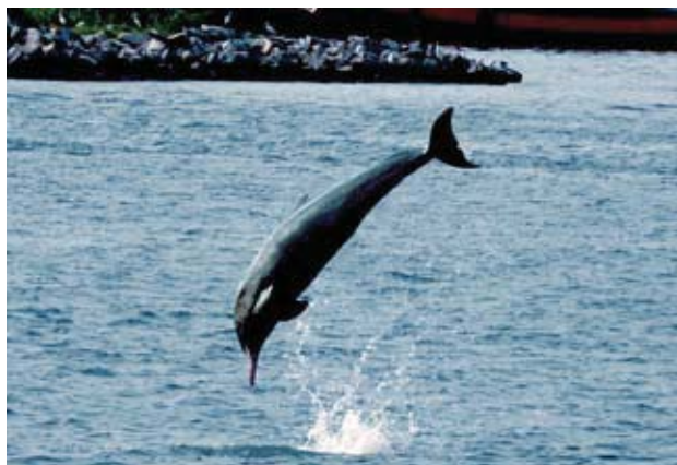
Fig. 10 Somersault

Specific courtship behaviours were not noted during the present study. However, behaviour patterns similar to courtship, such as frequent exposure of almost half of the body above the water and prolonged body contact (Fig. 11), followed by aerial display of quasi-leaps, side leaps or vertical leaps were observed.