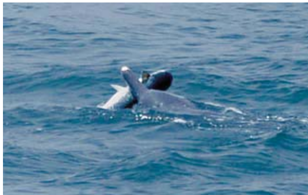
Fig.5 Movement of S. chinensis with mullet in mouth

feeds on several species of demersal and estuarine fishes, but with little evidence of predation on cephalopods or crustaceans (Jefferson and Hung, 2004). Stomach analysis of humpback dolphins caught from Mangalore, southwest coast of India, showed the presence of Nemipterus sp. , Saurida sp. and Lactarius lactarius (Anoop et al. , 2008). The preferred prey items of humpback dolphins include herrings, shad, sardines, mullet, croakers and grunts, which are typically estuarine, demersal or benthopelagic species, while cephalopods and crustaceans are found in small amounts in their stomach (Jefferson and Karczmarski, 2001; Ross 2002).