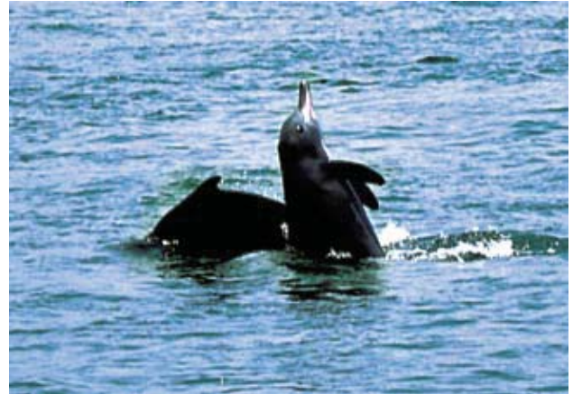
Fig.11 Prolonged body contact with vertical leap

Specific courtship behaviours were not noted during the present study. However, behaviour patterns similar to courtship, such as frequent exposure of almost half of the body above the water and prolonged body contact (Fig. 11), followed by aerial display of quasi-leaps, side leaps or vertical leaps were observed.