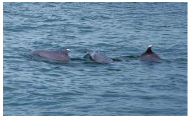
Fig.2 A group of S. chinensis represented by three individuals (with the hump at the base of the dorsal fin)

The Indo-Pacific humpback dolphin can be distinguished by the presence of a long, well-defined beak and a prominent hump or ridge along the back of the animal (Fig. 2). They were found all the year round in the estuary and the majority of sightings were along the main channel. This species typically has a near-shore distribution throughout its range, primarily up