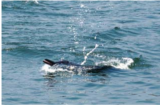
Fig. 4 Capture of mullet tossed up in air