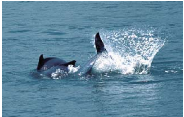
Fig.7 Socialising movement with body contact

We also observed vertical leaps (Fig. 8), side leaps (Fig. 9) and somersaults (Fig. 10). These aerial behaviours, however, were not frequent and were recorded only occasionally during the periods of observation. Vertical leaps, side leaps and