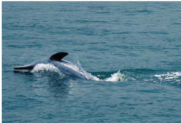
Fig.9 Side leap