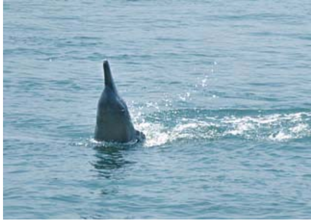
Fig. 8 Vertical leap