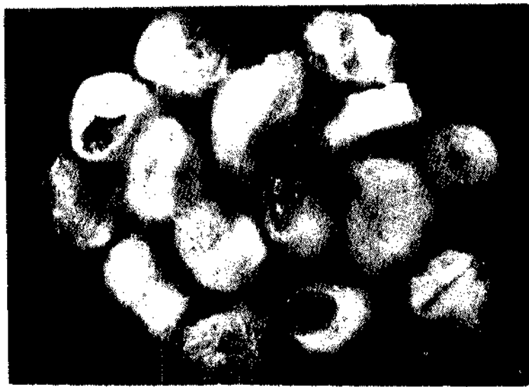
Plate I. Paratectia keralensis Gen. et sp. nov.