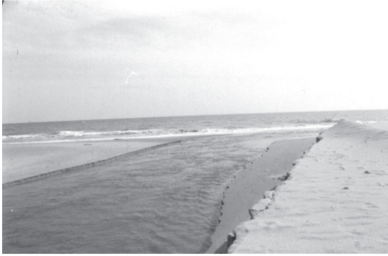
Fig. 1. Open sea area where the effluent from DCW joins the sea (station 1)

N lat.; 78° 08' 201" E long.) is open sea area where the effluent water joins the sea (Fig.1). Station 2 (8° 35' 638" N lat.; 78° 08' 165" E long.) is the lagoon of DCW, which is about 3 km long and 1 km wide, protected by a bund nearer to the open sea. To study the impact of effluent discharge in bulk, for the period from December 2007 to December 2008, monthly water sampling and analysis of parameters like temperature, pH, dissolved oxygen, mercury, carbon dioxide, chlorophyll and total suspended solids were carried out from six stations i.e. , the first two stations 1 and 2 were covered during 1999-2002; station 3 (8° 34' 984" N lat.; 78° 06' 121" E long.) is a part of the lagoon on the opposite side of station 2, where pumping of saline water from the backwaters was continued for reducing the effect of pollution; station 4 (8° 34' 838" N lat.; 78° 08' 244" E long.) was one km away from station 2; station 5 (8° 30' 958" N lat.; 78° 07' 370" E long.) was eight km away from station 4; station 6 (8° 29' 668" N lat.; 78° 07' 730" E long.) was three km away from station 5, where the pilgrims visit the Thiruchendoor temple to take sea bath; and station 7 (8° 27' 917" N lat.; 78° 06' 078" E long.) was 6 km away from station 6. The station locations are shown in Fig. 2.